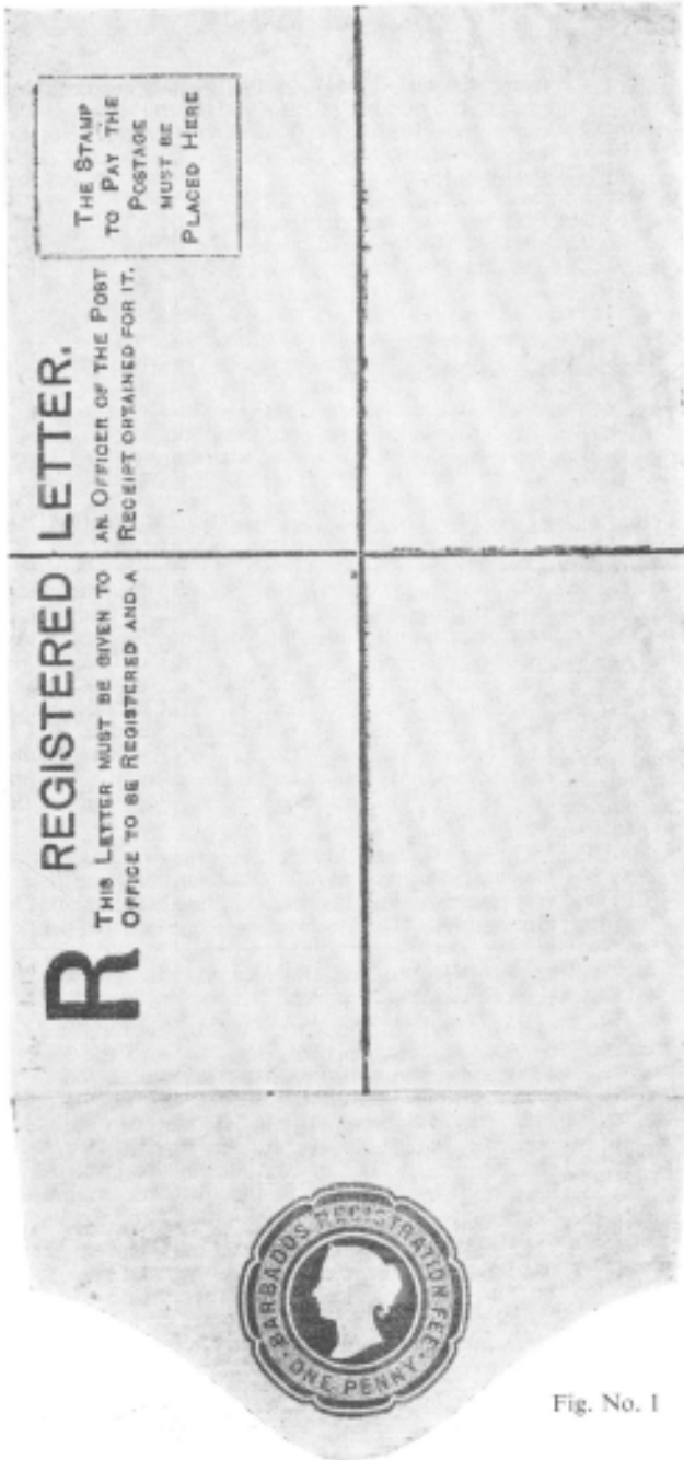
Fig. No. 1